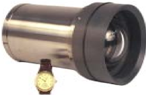
7,000 Meter Glass Hemispherical Dome Housing