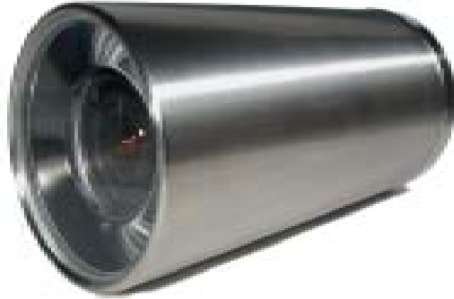
4,500 Meter Titanium Housing

This camera is small and ideal for applications that do not justify the cost of a SIT camera but where high sensitivity is required.